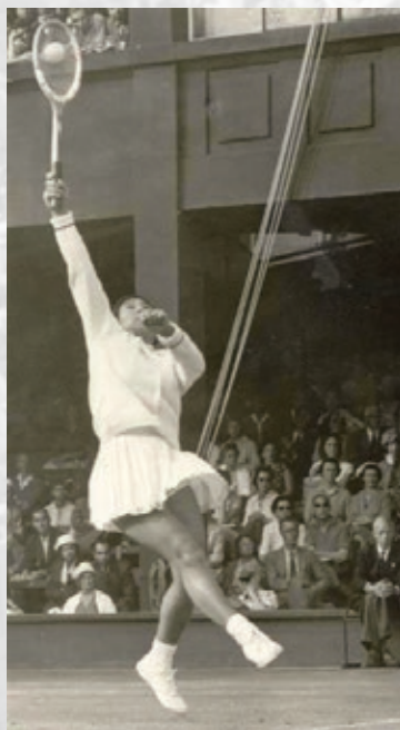
1960 Wimbledon Doubles