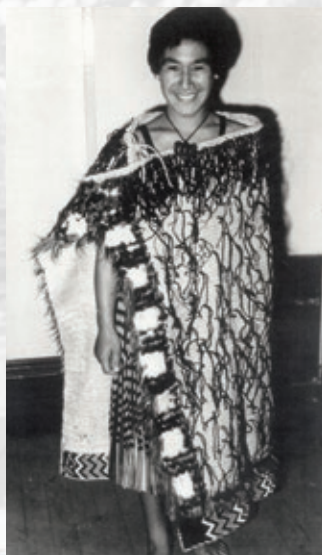
1956 Wimbledon fundraising Auckland Town Hall