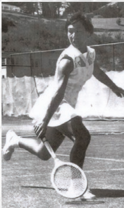
1958 Ruia in Teddy Tingling dress (Wgtn)