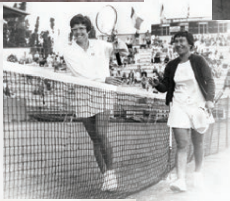
69 Stanley St v Billie Jean King