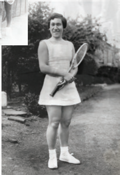
Ruia 1957 Cumberland 1st tournament on English soil